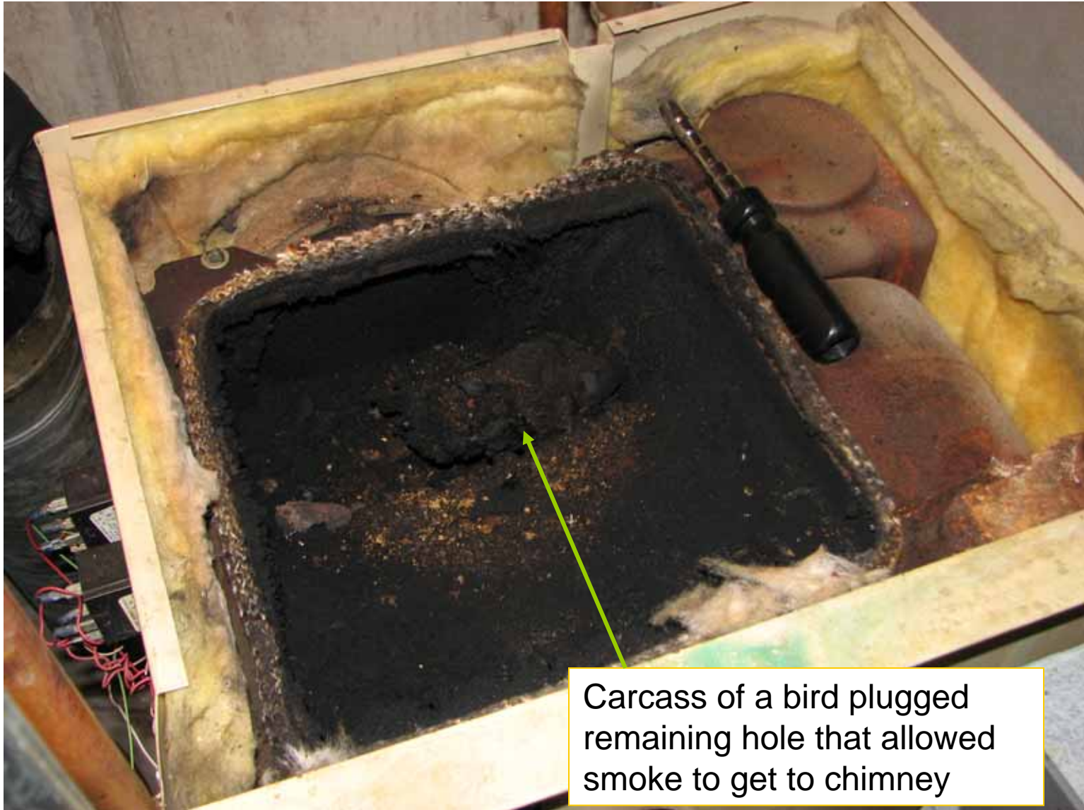
Carcass of a bird plugged remaining hole that allowed smoke to get to chimney